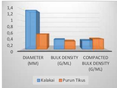
Figure 3. Comparison of Physical Complete Feed Granule Of Different Swamp Forages (mean \pm SEM) n=36)