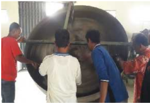
Figure 1. Granulator machine used in the production of complete granule feed

Produce complete feed granules. In the manufacture of complete feed granules several stages of the Producing process follow by reducing the size of the material to be uniform, mixing feed ingredients, wetting, screening, , separation of granule particles and drying. The ingredients used are 50% indigofera legume, 20% swamp forage, 10% starch flour, 16% rice bran, 2.5% molasses, 1.5% salt. Granulator machine used has dimensions 2500 x 2400 x 2000 mm, capacity 250 kg / hour, electric motor 3 hp specifications dimensions 2500 x 2400 x 2000 mm capacity 150 kg / hour, slope angle 50 degrees, frame UNP 80, Thick Cylinder Plate 2 mm, Material Stainless steel, transmission Gear Box, V-Belt Pulley, Electric Dynamo Drive 1 Pk, 750 Watts / Solar Motor 5.5 PK.