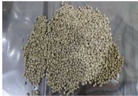
Figure 2. Complete granule feed mixture swamp forage with legume

Bulk Density (BD). Measured by pouring feed ingredients into a measuring glass in a measuring cup using a funnel and teaspoon to a volume of 100 ml. The measuring glass containing the ingredients is weighed. On every entry of material that must be the same both way and height in pouring. During pouring material must be avoided from material shocks. As for the calculation of stack density is by dividing the weight of the material by the volume of