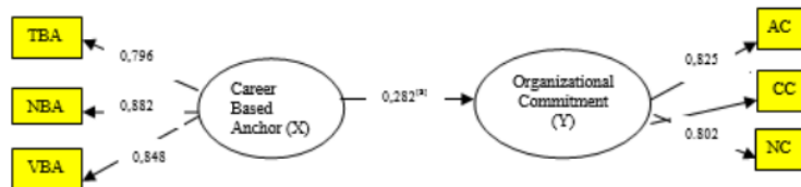
Figure 2: Output of research variables

To explain the connection between variables can be discovered a picture of the subsequent relationship Amos Output. The check consequences of the structure model are shown in the diagram underneath as proven beneath: in line with table 2 and figure 2: