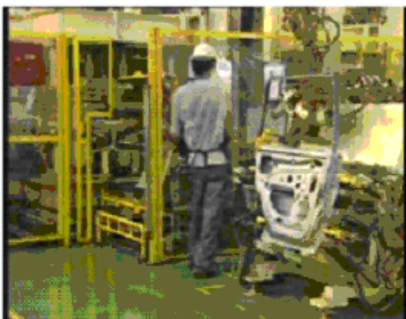
Figure 4 The car-door product of the company