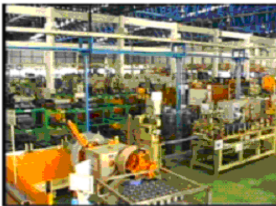
Figure 3 Assembly lines at M/S Ingress Precision Sdn. Bhd.

Table 2 shows the utilization for each workstation on production line RF1-D1 which resulted from the input data in Table 1 and calculated by using