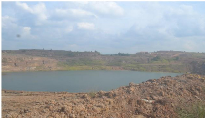
Figure 2. Mining Effect To Soil Landmark