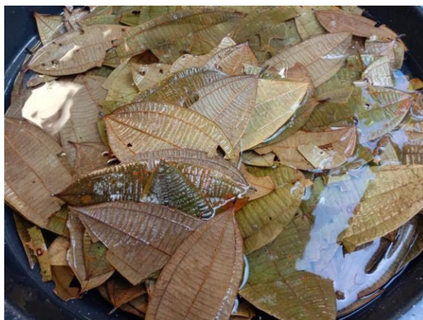
Fig 1. Sintok lancang ( Cinnamomum javanicum Blume.)