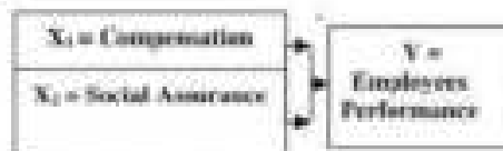
Fig. 1. Framework of Research